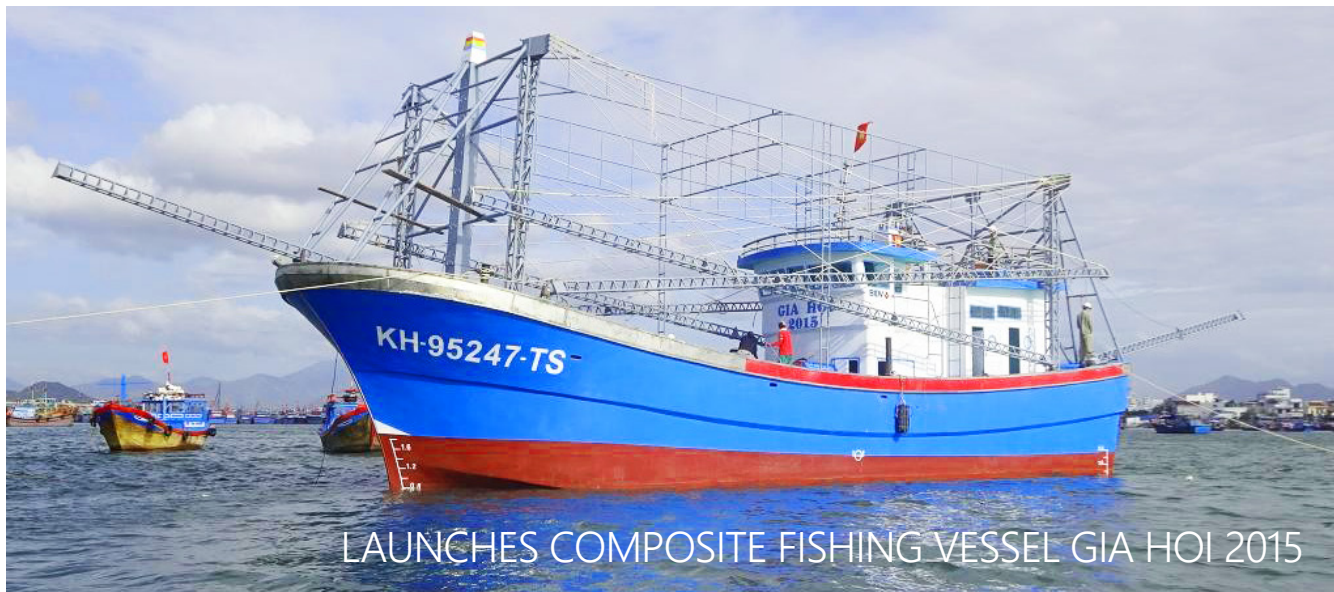
LAUNCHES COMPOSITE FISHING VESSEL GIA HOI 2015

After more than four months of construction, on January 25 th , 2016, the composite fishing vessel Gia Hoi 2015 (number KH - 95247) was launched. This is the second composite fishing vessel designed and built for a fisherman in Khanh Hoa province and also the fourth composite ship, nationwide, built with financial assistance from the Government according to the Decree 67.