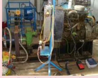
The successfully manufactured controller (left) and the experimental layout in reality on Yanmar 4CH engine at the Department of Internal Combustion Engine