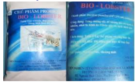
Probiotics Bio - Lobster 1 and 2