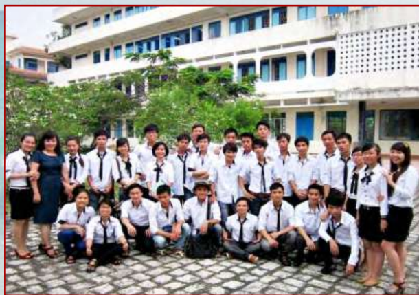
Students and Staff of the Institute of Aquaculture

To enhance the efficiency of training and research, the Faculty of Aquaculture and Cam Ranh Research Institute for Aquaculture have been integrated to form the Institute of Aquaculture, officially effective beginning September 1 st , 2013. Currently, the Institute has 53 faculty and staff members, including 1 associate professor, 9 doctors, and 33 masters. The Institute consists of 3 departments (Freshwater Aquaculture, Brackishwater Aquaculture, and Marine Aquaculture) and is running 3 modern aquaculture farms (Ninh Phung Experimental Research Farm, Cam Ranh Aquaculture Farm, and Vung Ngan Marine Aquaculture Farm). Over 54 years of development, the Institute has trained thousands of engineers, 125 masters, and 25 doctors for the aquaculture sector. The graduates with high qualifications have responded well to the needs of fisheries economy development of Vietnam.