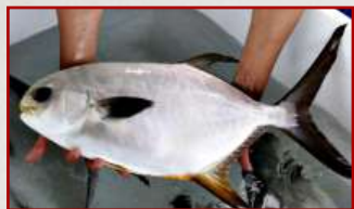
Yellowfin - butterflyfish