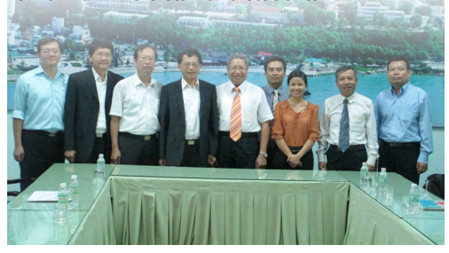
NTOU and NTU leaders at Nha Trang University

In addition, the NTOU delegation held a scholarship information session and shared experiences in scholarship applications for studying in Taiwan for NTU's staff and students.