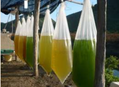
Algue biomass to feed Artemia