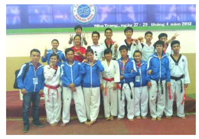
NTU Taekwondo Team

The NTU student Taekwondo Team competed in a number of categories at the 7<sup>th</sup> Khanh Hoa Sports Festival in 2013. With great effort and spirit, NTU's team gained remarkable achievements: two gold medals (antagonism team, individual antagonistic male at weight from 58-62kg), three silver medals (boxing team, boxing male-female couple, individual antagonistic female at weight from 42-46 kg) and 4 bronze medals.