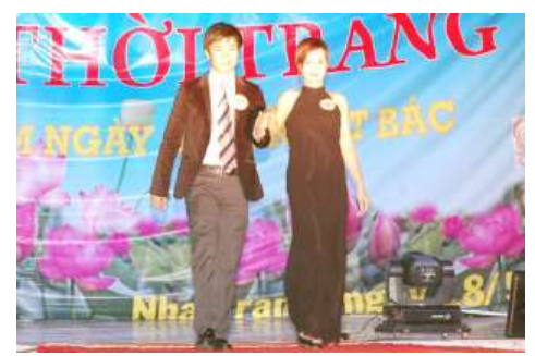
Fashion Contest at NTU (page 7)