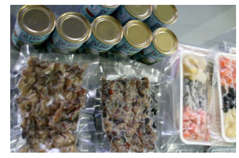
Salted sea cucumbers and frozen smoked dried sea cucumbers

The success of this project has not only contributed to improving the quality of sea cucumber products, but also significantly reduced manufacturing costs of this nutritious food. In addition, the project results have also created new opportunities for aquaculture and fishing of sea cucumbers in Khanh Hoa Province.