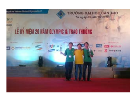
The NTU Team - Beach Star

With outstanding performances, the NTU team - Beach-Star-NTU - won the third prize among 85 strong teams from other universities, colleges and institutions. In addition,