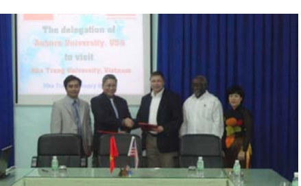
Leaders of Nha Trang University and Auburn University signed the Collaboration Agreement (January 6th, 2012).

Research Cooperation with Long Sinh Co.,Ltd. Research cooperation with Long Sinh Co.,Ltd. In January, 2012, NTU signed a contract with Long Sinh Co., Ltd to conduct a research on chitosan. NTU will receive financial support from Long Sinh to carry out the study and experiment the production of chitosan. In addition, the Company will provide scientific materials related to the testing of chitosan on plants and some fisheries subjects. As for Nha Trang University, this is one of the activities that it promotes as regards the application of scientific research to solve real-life problems.