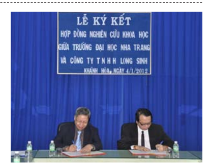
Signing research contract with Long Sinh Ltd. Company

Research Cooperation with Long Sinh Co.,Ltd. Research cooperation with Long Sinh Co.,Ltd. In January, 2012, NTU signed a contract with Long Sinh Co., Ltd to conduct a research on chitosan. NTU will receive financial support from Long Sinh to carry out the study and experiment the production of chitosan. In addition, the Company will provide scientific materials related to the testing of chitosan on plants and some fisheries subjects. As for Nha Trang University, this is one of the activities that it promotes as regards the application of scientific research to solve real-life problems.