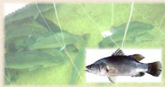
Waigieu Seaperch larvae by artificial reproduction techniques (above) and a mature Waigieu Seaperch – one of the successful products of the Center