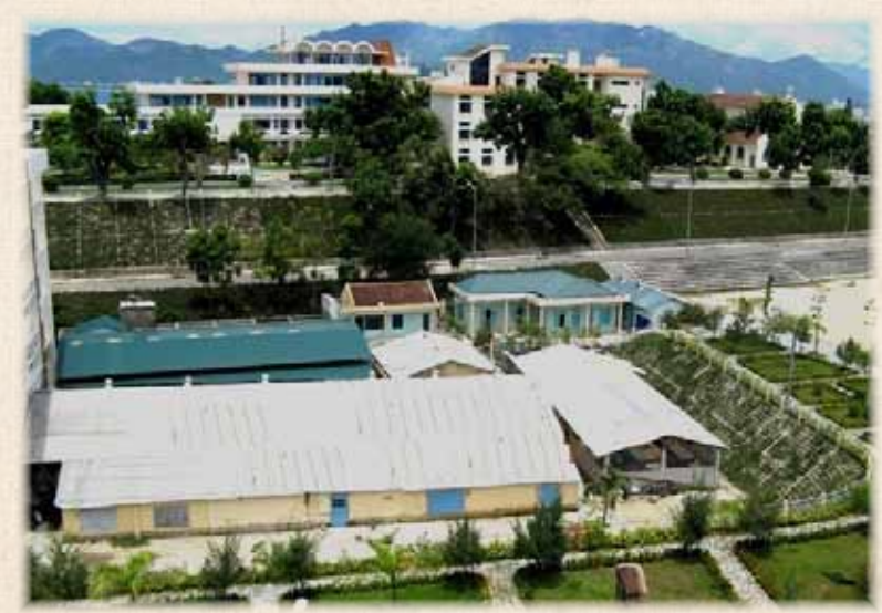
The Center in NTU's main campus

At present, the center is transferring techniques of producing the artificial breed of Lates calcarifer to some local businesses. Concurrently, a research on the response of barramundi's immune system to Streptococcus iniae bacteria is taking place at the center. Plans to produce vaccines to protect barramundi from this kind of bacteria are under way. The center has also started experiments to produce breeds of spiny lobsters ( P. ornatus ) by an artificial reproduction process in Khanh Hoa.