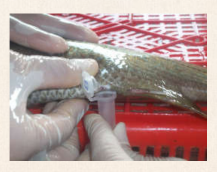
Obtain Waigieu Seaperch's sperm

The findings of this research will benefit the reproduction of Waigieu Seaperch, and help build a sperm bank for this species as one kind of marine finfish in Khanh Hoa and central Vietnam.