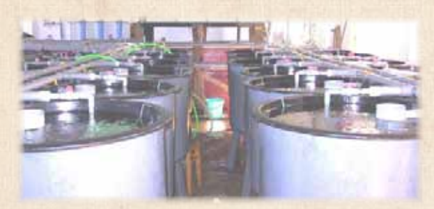
Tanks for Fish Larvae Nutrition Research