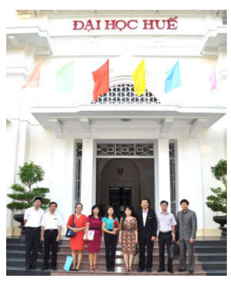
NTU delegation with leaders of Hue University

The meetings provided opportunities for participants to discuss and exchange experiences in training management, scientific research, and external cooperation. Each university also agreed to a commitment to advance more cooperative activities based on the strengths of the respective university, starting with improving the joint programs among the universities.